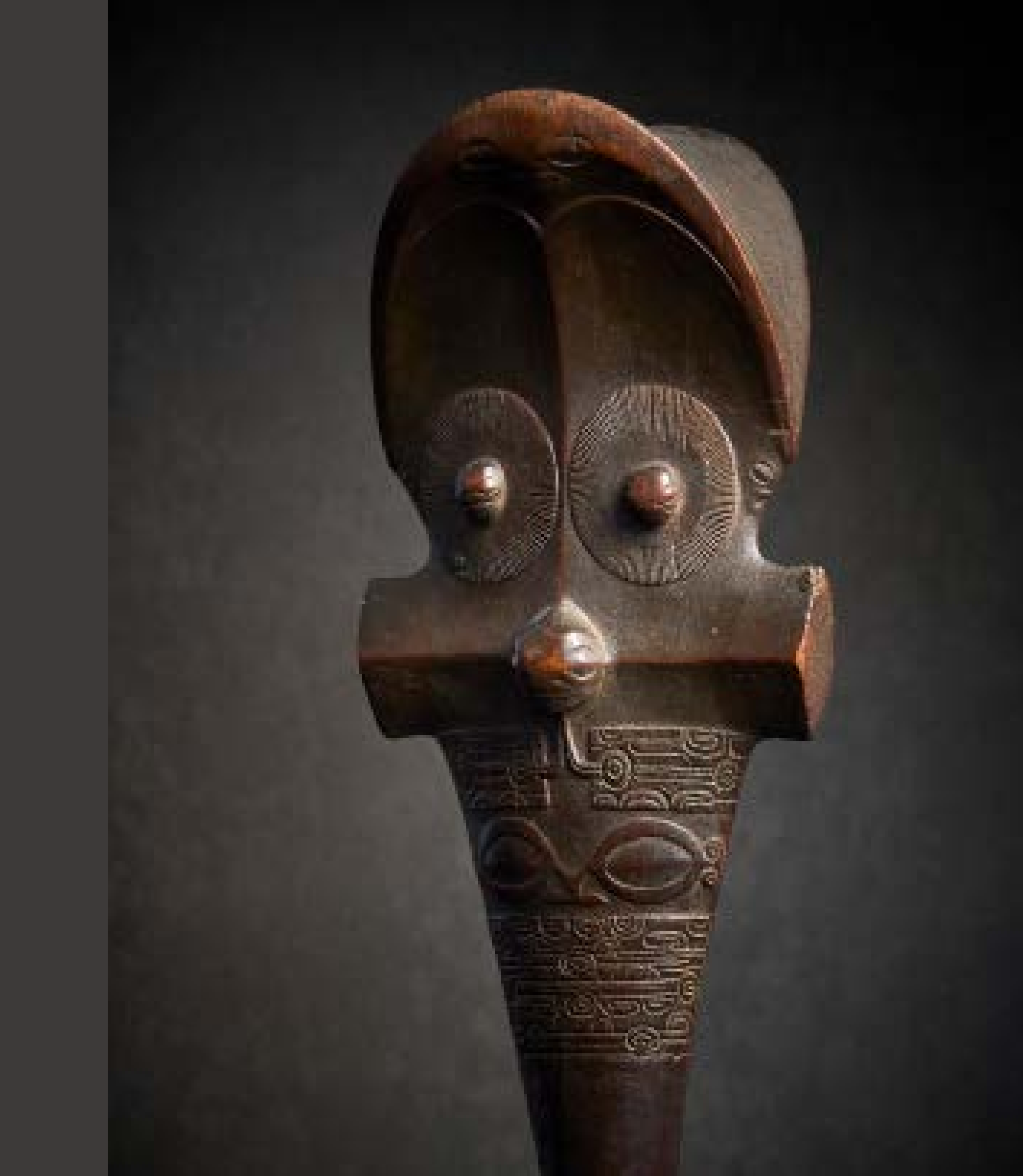
U'u , war club, Marquesas Islands