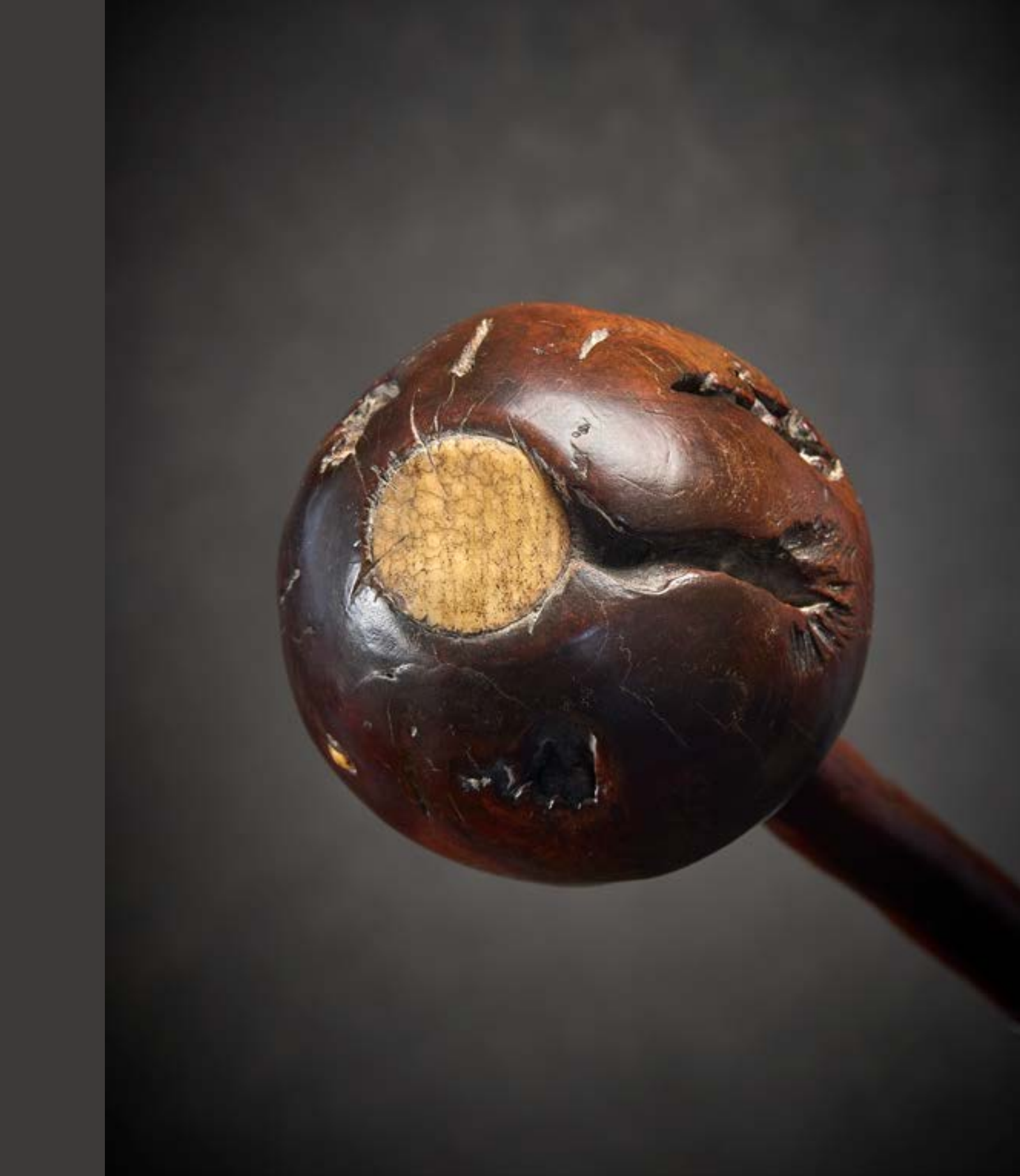
Inlaid Ula, Fiji Islands