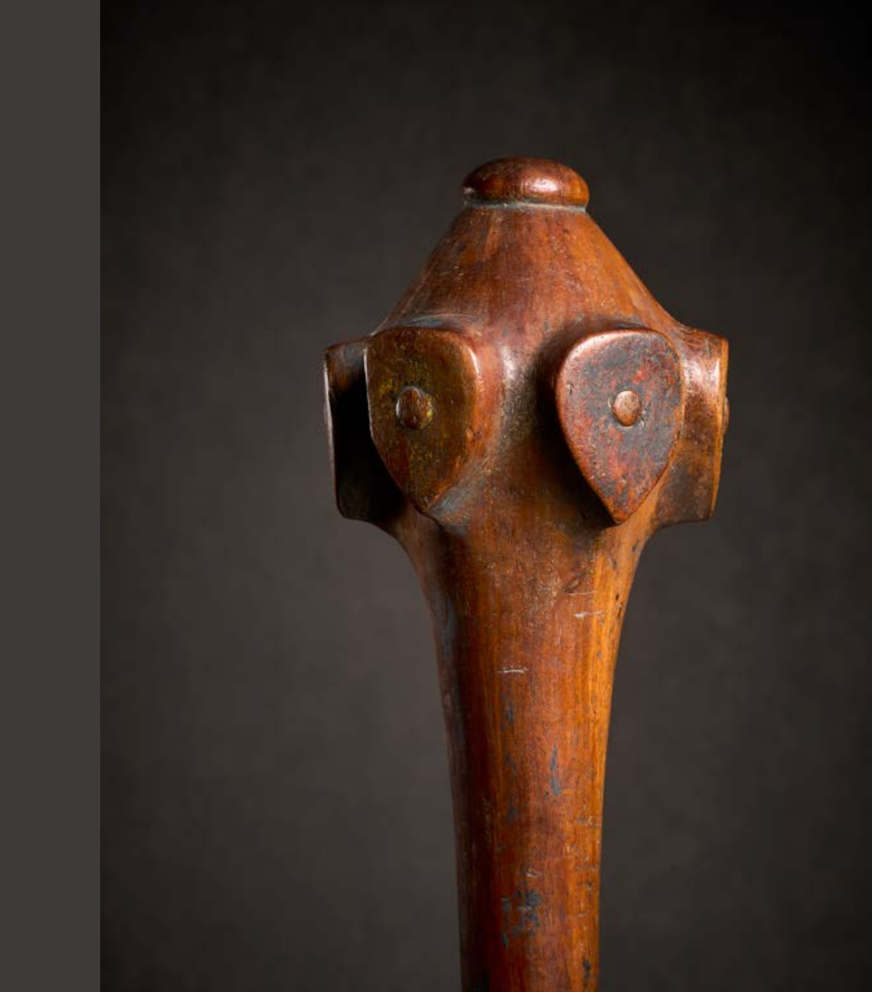
Kolo, throwing club, Tonga Islands