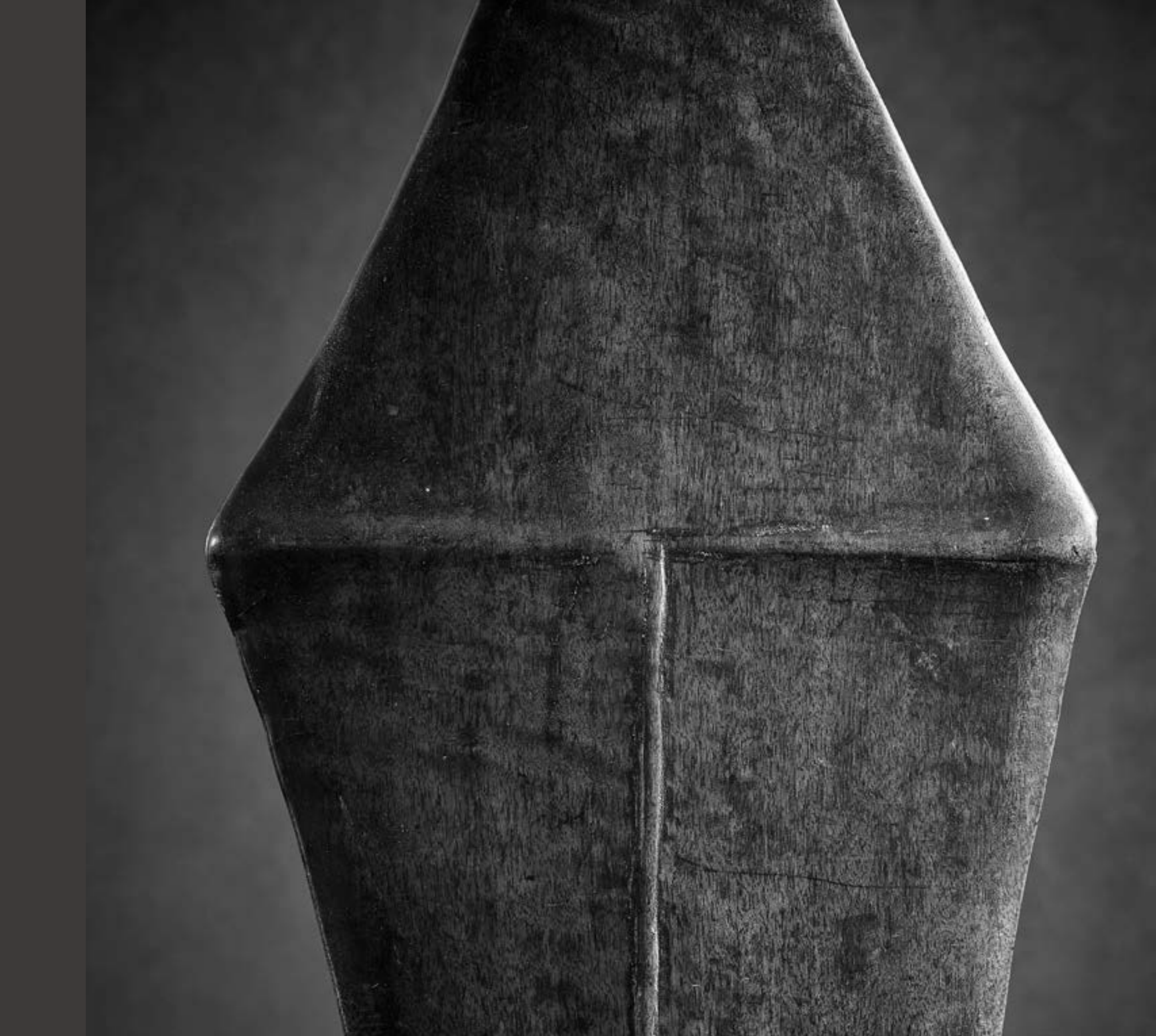
Supi, war club, Solomon Islands