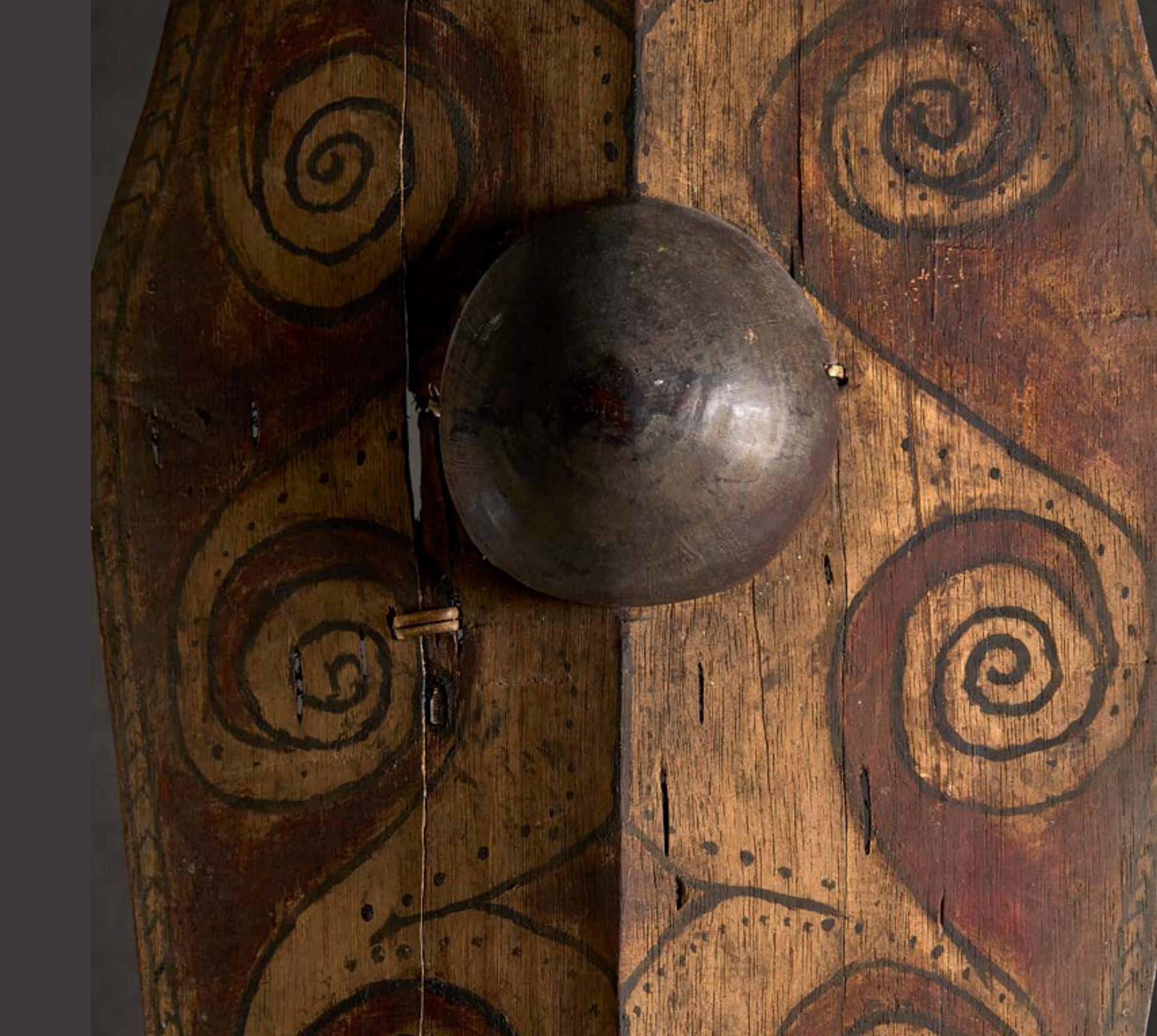
Kurabit, Mentawai shield, Indonesia