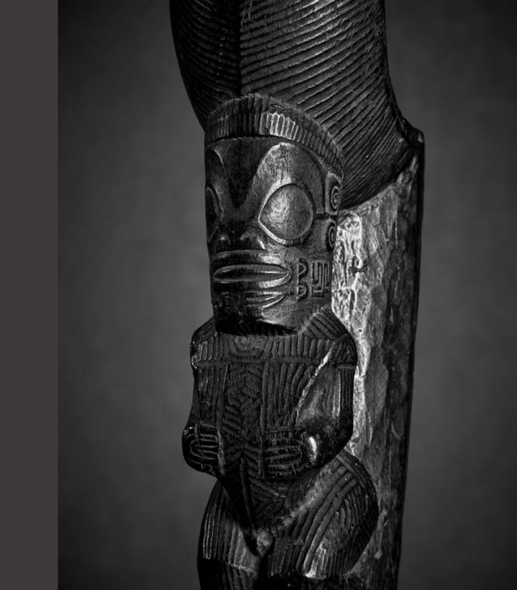
Tapuvae, wood stilt step Marquesas Islands