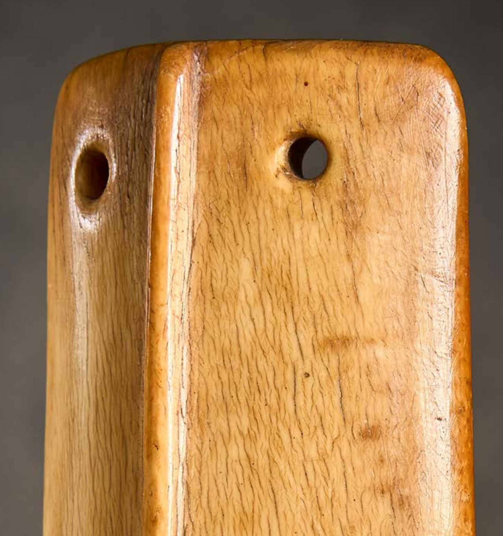
Komé, Lobi pendant, Burkina Faso