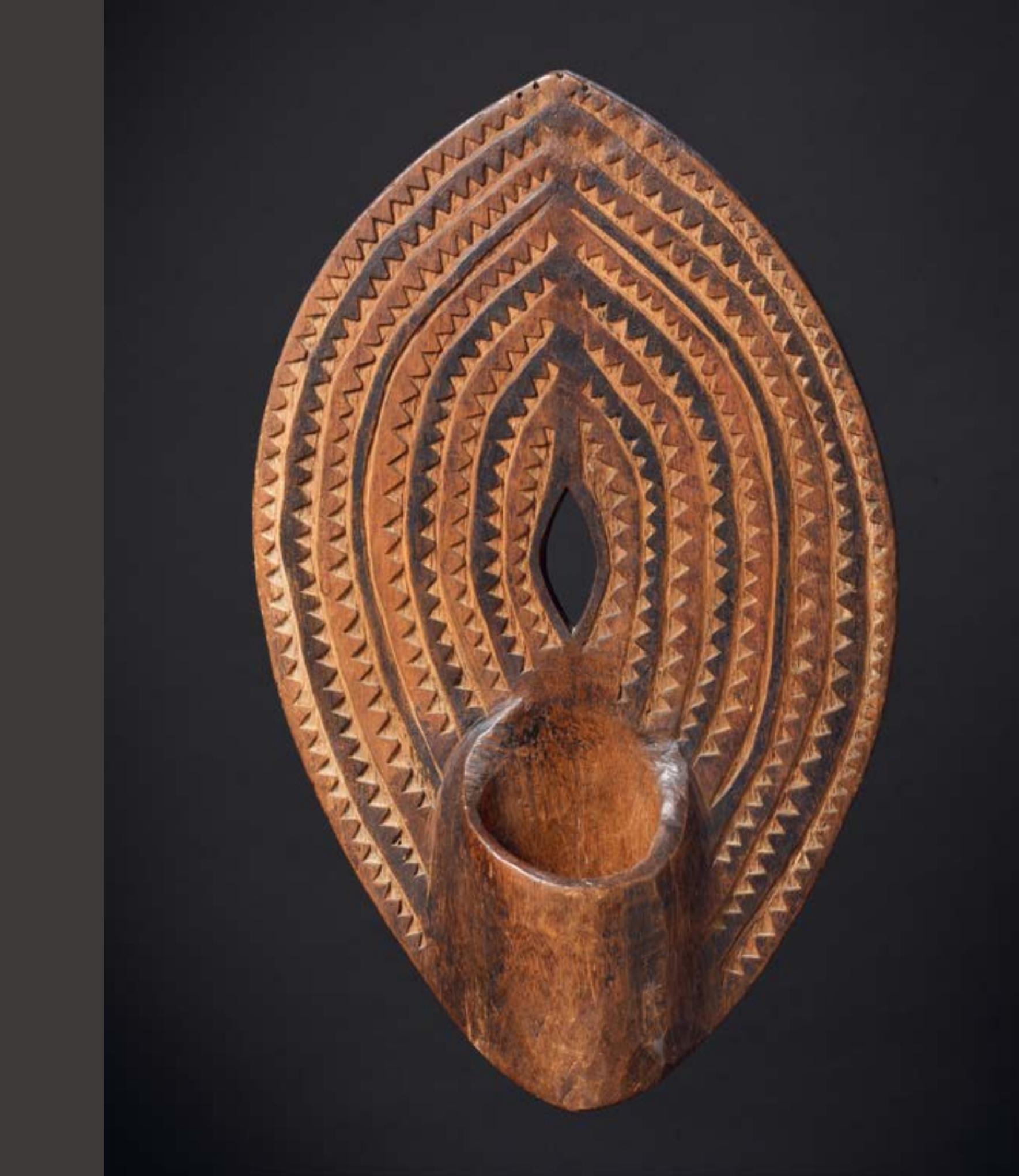
N∂ome, Kikuyu shield, Kenya