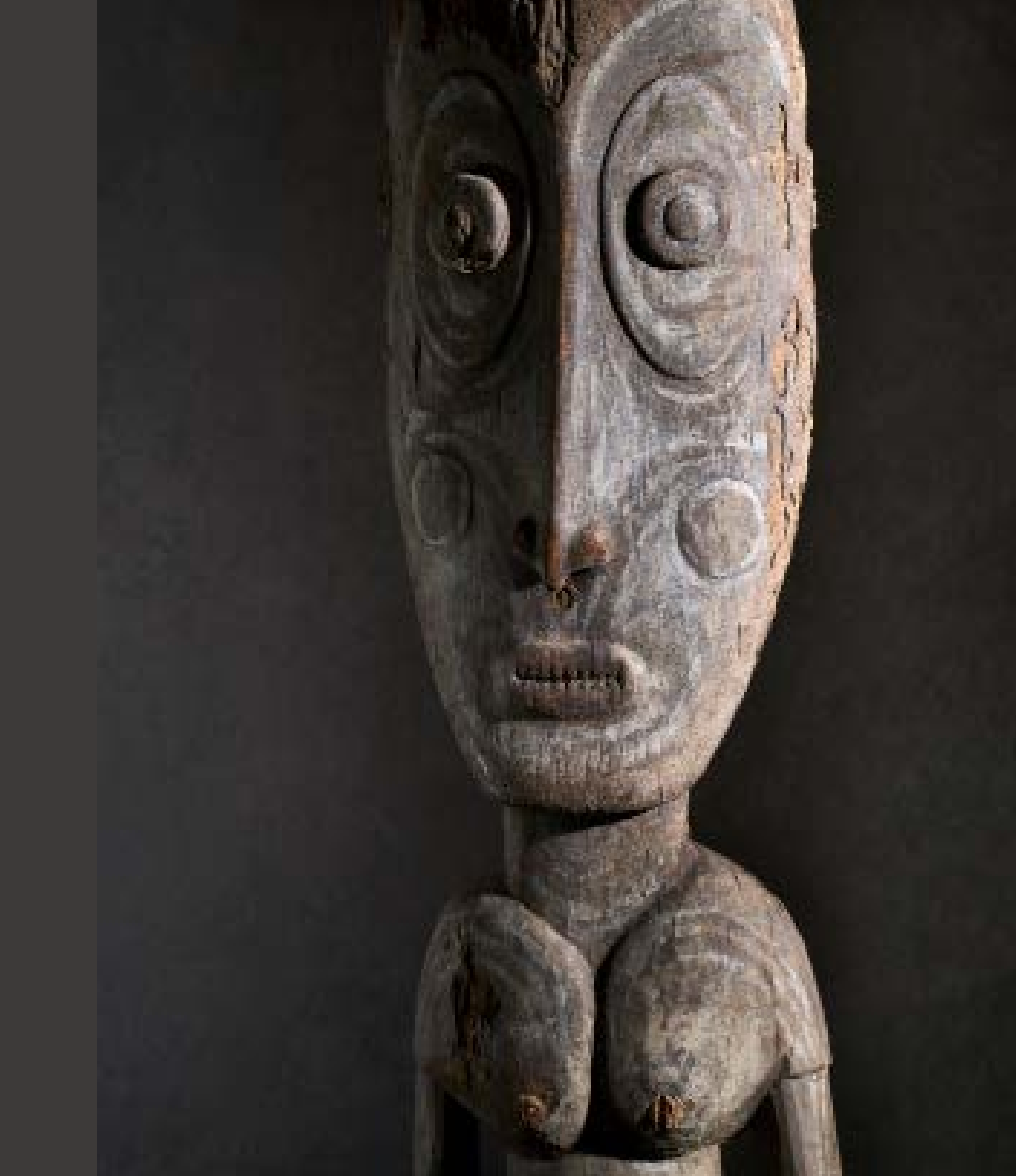
Iatmul ancestor figure Papua New Guinea